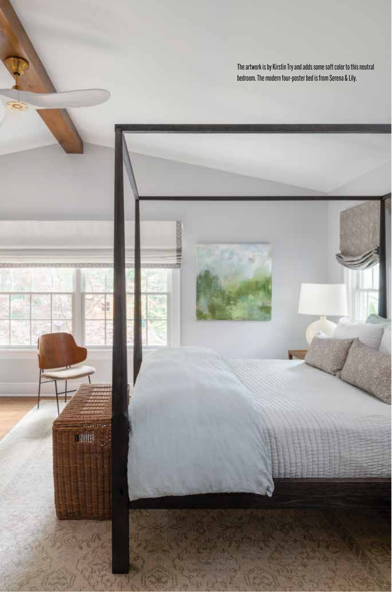
The artwork is by Kirstin Try and adds some soft color to this neutral bedroom. The modern four-poster bed is from Serena & Lily.