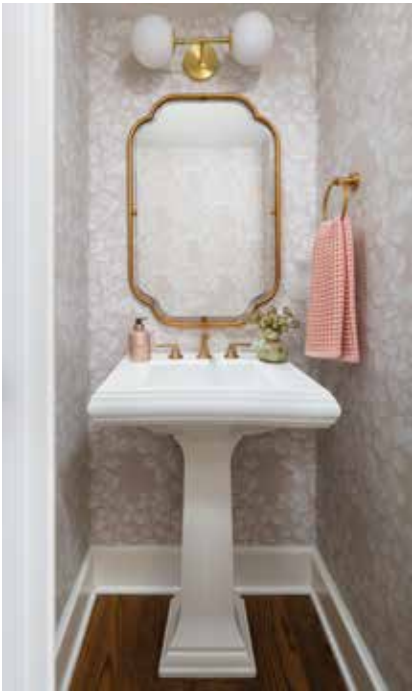
Above | The new main bathroom features over-scale dark tiles, clean white walls, and a warm wood double vanity. Below, left | A wicker chest offers blanket storage and a cozy touch to the main bedroom. Below, right | The powder room was refreshed with new lighting and botanical wallpaper.